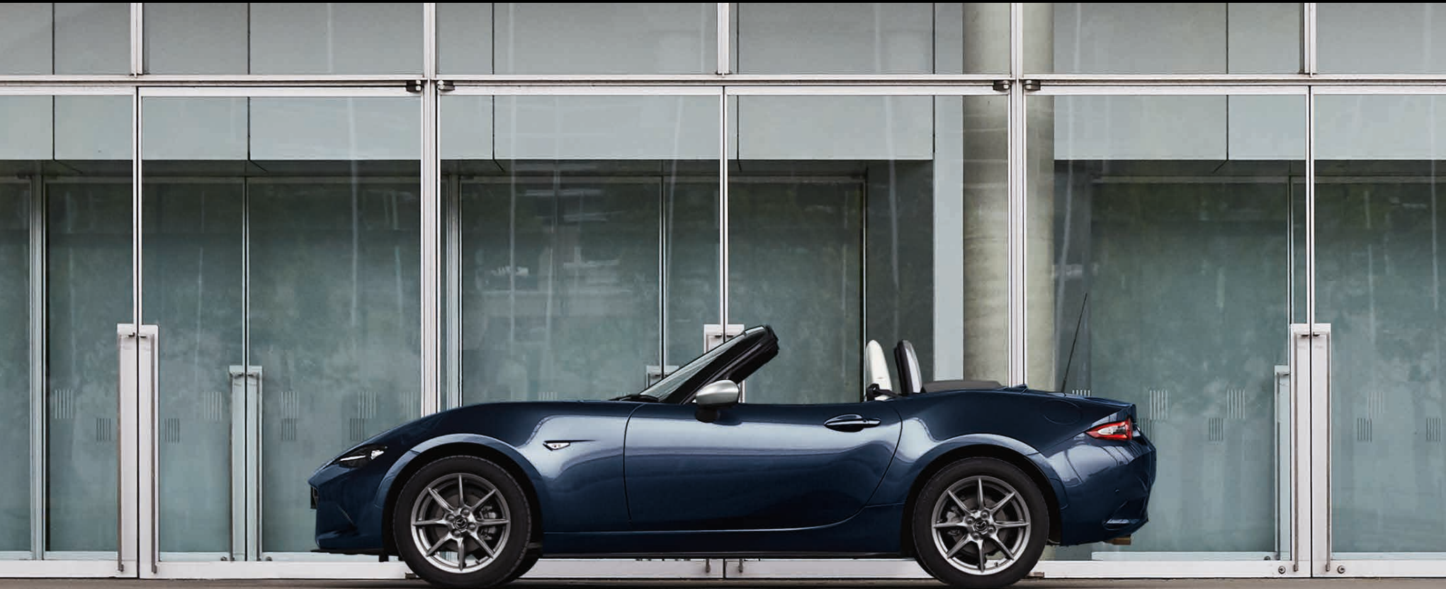
MAZDA MX-5 SPORT VENTURE